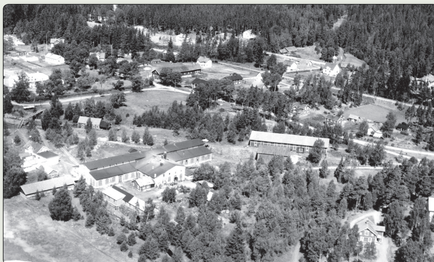
Aerial view of Bruzaholm in 1947 with the iron works bottom left.

N 6388789 / E 516025 (SWEREF 99 TM) // N 57° 38' 28.155", E 15° 16' 6.473" (WGS84)