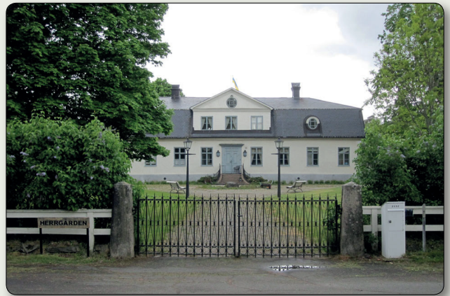
The manor from the 1780s.

A further plant for making woven wire fabric was set up in a more central location. Due to the owner's great interest in landscape gardening, Kristallen, an ultra modern greenhouse and garden nursery built like a cube, was erected in 1960.