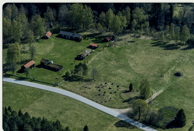
Aerial photo from the south-west of Västbo rural community centre and stone circles in Smålandsstenar. The river Nissan flows behind the screen of trees.

Ever since stone circles were first constructed in the Bronze Age, people have been fascinated by them. Carl Linnaeus, for example, thought that they were thingsteads, while others believed that they were intended for healing illnesses, sacrificial offerings to the gods, ancestor worship, astronomical studies or gathering places for large feasts. In local tradition, some stone circles are referred to as Danish graves, relating to the Danish military expeditions in the 1560s. Today, the grave field with stone circles is one of the hidden gems of the county and the scene of the annual local Walpurgis Night celebrations.