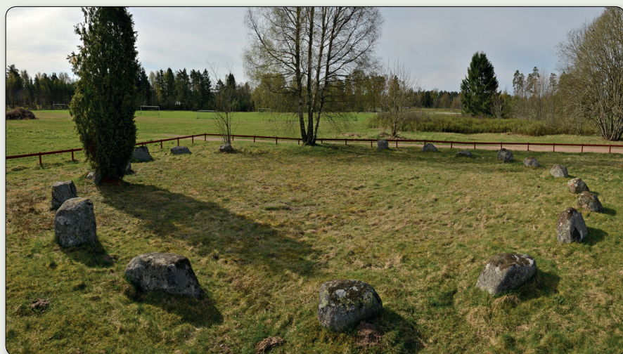
One of the stone circles in the grave field in Smålandsstenar.

N 6337618 / E 404952 (SWEREF 99 TM) // N 57° 10' 18.86", E 13° 25' 40.93" (WGS84)