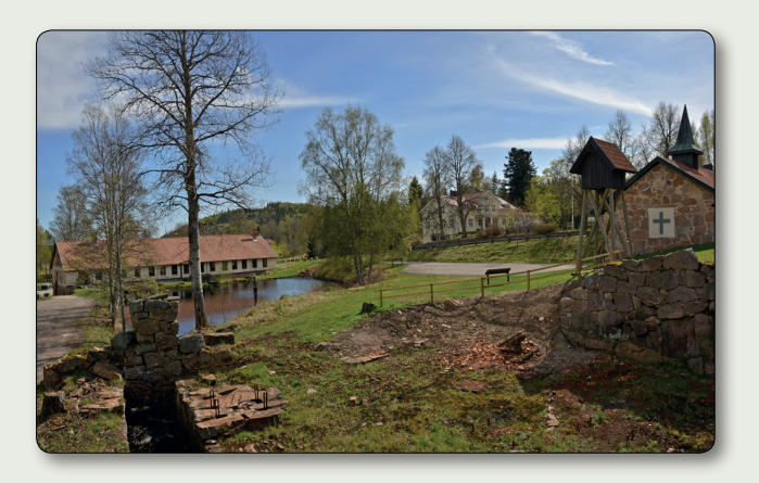
Marieholm Works. To the right is the church, originally a stone warehouse. To the left, the old factory with the cofferdam in front.