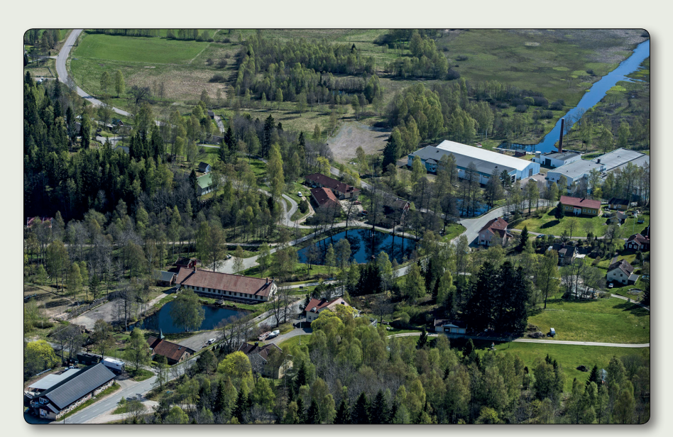
Industrial environment in Marieholm, determined by the watercourse.

Walking trails along the river Skärvån pass, for example, the ruins of Saxhyttan rolling mill. The importance of water power for the development of industries here is still obvious through the well-preserved dam system along the river Skärvån's watercourse.