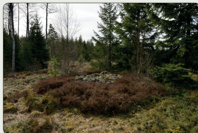
This stone setting is found in the grave field north of Kyrkesten.