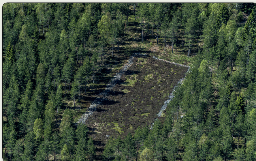
View over Kyrkesten from north-east.

Coordinates: N 6415662 / E 436843 (SWEREF 99 TM) // N 57° 52' 42.01", E 13° 56' 6.39" (WGS84)