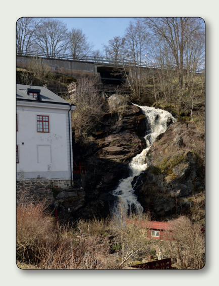
In line with the Storkvarn mill, the Dunkehalla river rushes down in a dramatic way.

From the sprawling settlement of workers' dwellings that was here a hundred years ago, only a fragment remains; the picturesque small wooden houses by the bridge.