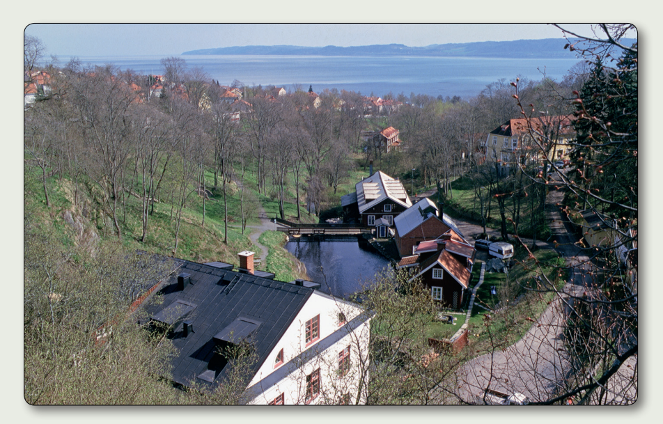
The built environment in the Dunkehalla ravine mainly comprises old industrial buildings and workers' dwellings

Coordinates: E 449060 (SWEREF 99 TM) // N 57° 47' 14.43", E 14° 8' 35.73" (WGS84)