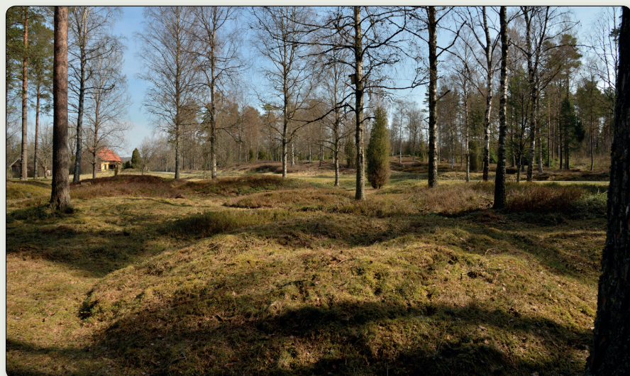
Along the road, around 400 metres south of Bringetofta Church, is a Viking Age grave field with more than 150 graves by way of mounds and stone settings.

Coordinates: Bringetofta Church: N6366976 / E 477124 (SWEREF 99 TM) // N 57° 26' 41.64", E 14° 37' 7.94" (WGS84)