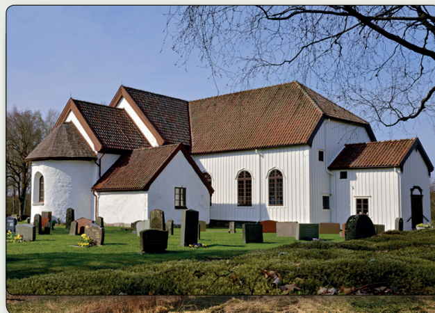
The medieval church was built in stone. In the 18th century, when the congregation no longer fitted into the building, a wooden extension to the north was added.

An Iron Age burial cairn field with more than 150 graves is found in the sparse forest on both sides of the road at the crossroads towards Åse, when you approach the church from the south. There are both mounds and stone settings. In the surroundings you can also find old routes, also called holloways, probably from the Viking Age. The well-preserved church village Bringetofta with its surrounding environment of ancient monuments could be said to be part of the core settlement of the medieval independent "land" of Njudung.