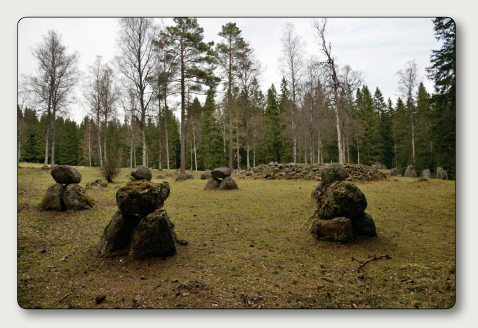
Fagertofta Grave Field. In the foreground, a composition of Iron Age dolmens.