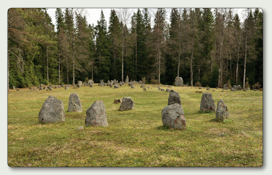
Fagertofta Grave Field. In the foreground, a stone circle.

At the parking area next to the grave field is a well called "Midsommarkällan" (midsummer well). To keep healthy, people drank the water or washed in it during the midsummer night. Do use the spring, but beware of "playing thing" among the stone circles. According to an old legend, this will make you ill.