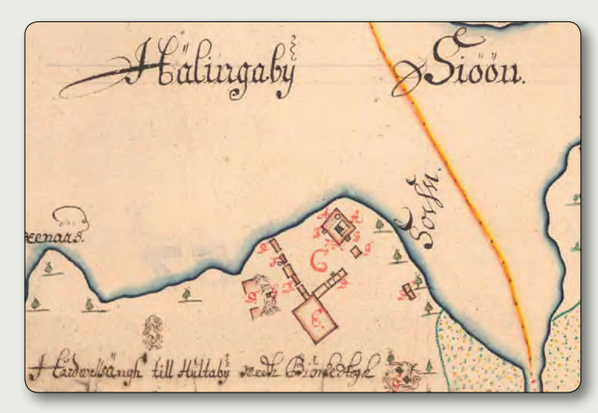
Extract from a geometric measuring 1693, also showing the castle grounds.

The ruins of Hultaby Castle were preserved in the 1930s and 1940s, when they were given their present appearance. Since then, the site is popular for excursions and a good setting for medieval games and markets.