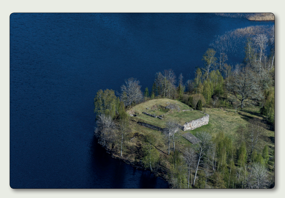
Hultaby Castle Ruins by Lake Norrasjön.

Coordinates: N 6364249 / E 502132 (SWEREF 99 TM) // N 57° 25' 15.50", E 15° 2' 7.77" (WGS84)