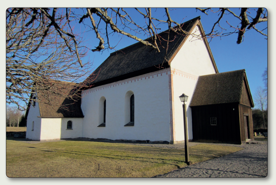
The church and portal seen from the south-east.

Coordinates: N 6359428 / E 491953 (SWEREF 99 TM) // N 57° 22' 39.36", E 14° 51' 58.21" (WGS84)