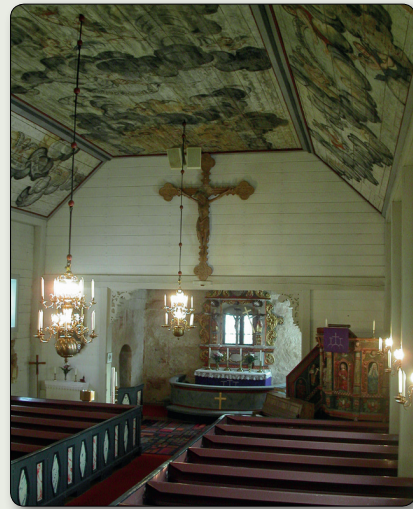
Interior from Haurida Church.