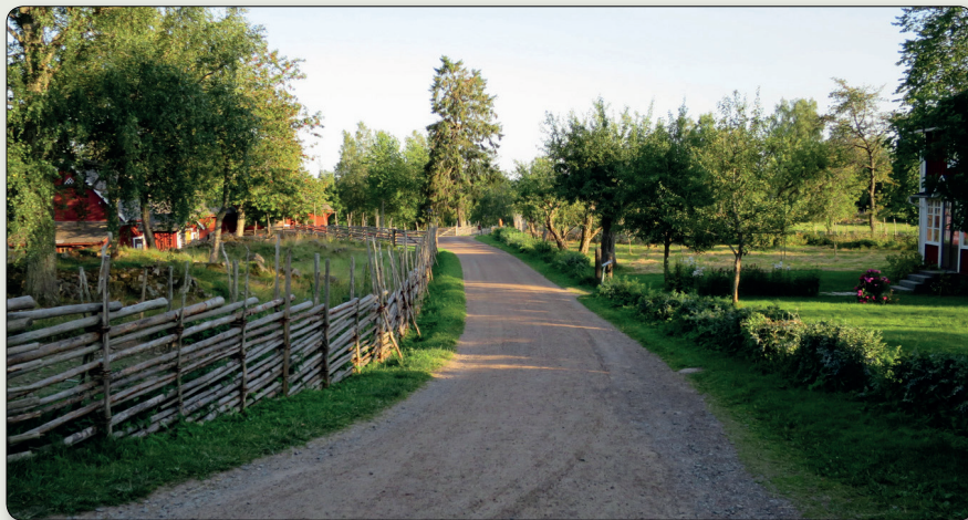
Village road through Åsens by.

The farms are surrounded by small fields, meadows, pastures, pollarded trees, stone walls, cattle paths and clearance cairns belonging to the village. The field clearance cairns are evidence of past farming methods. Since the village dates back to the Middle Ages, it is not surprising to find traces of previous agricultural practices. The fact that so much remains intact is because the land was never parcelled out. The old-fashioned village with its many activities is a popular attraction in the summer months.