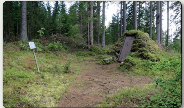
Johannes Andersson's hut.

The wiredrawing mill was located on the site of the village hall. A reconstructed water wheel reminds us of the industry. The hut is rebuilt in its original location, 300 metres to the east along the gravel road; follow the signs. The canal is best viewed from here, and you can then follow it upstream.