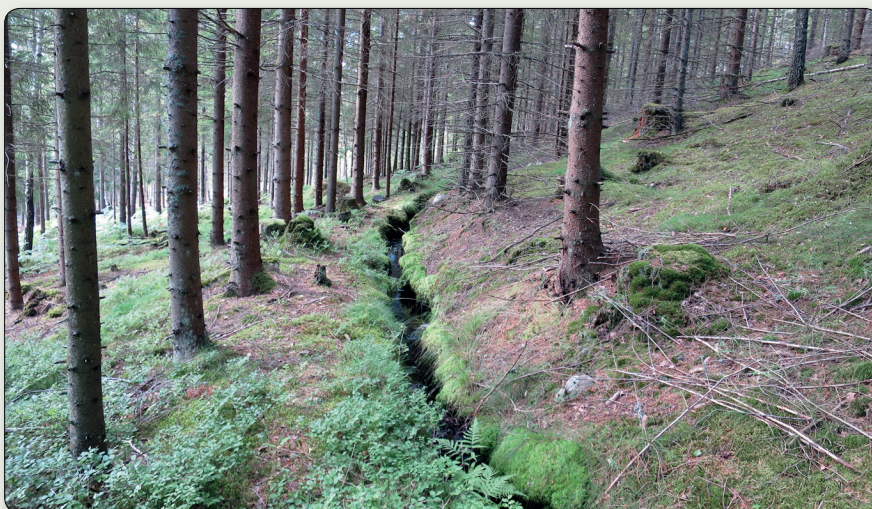
Part of Johannes Andersson's canal.

N 6351931 / E 425026 (SWEREF 99 TM) // N 57° 18' 15.03", E 13° 45' 20.19" (WGS84)