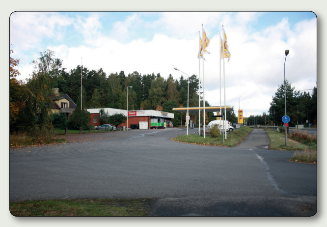
Röde påle filling station. Dödskallehöjden Tumulus is located in the grove in the background.