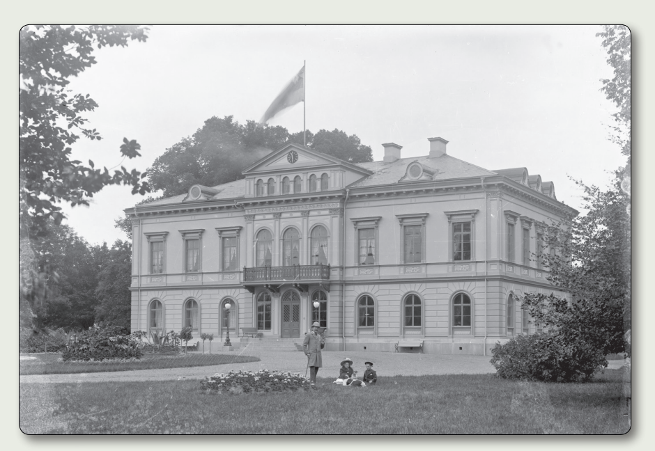
Lyckås manor in a photograph taken before 1905, since the union flag is flying.

You find several manors in the Skärstaddalen valley, e.g. Lyckås, Drättinge, Säby and Stackeryd. The manor house at Lyckås, built 1863, is particularly lavish. The exterior is an ornate plaster façade, and the interior has extensive decorative painting. The inhabited Karolin style manor house at Drättinge was built in 1926. Behind this building is a now disused old manor house, probably from the late 1780s. Farm buildings, crofts and tied cottages also belong to the manor environments. At Lyckås there is a former station house and a warehouse – both reminders of the narrow-gauge railway line that used to go between Jönköping and Vireda.