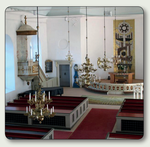
The altar piece in Skärstad Church is a mosaic made by the artist Bo Beskow in 1972.