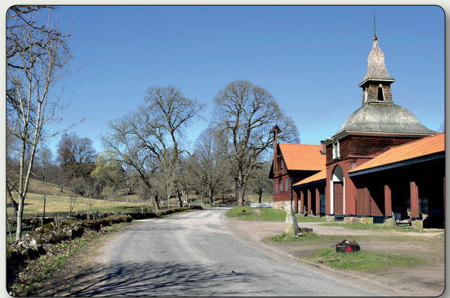
Parts of the farm buildings at Tunarp. The inscribed stone stands along the road.

While you are in the area, take the opportunity to visit the sunken lanes of the Eriksgatuleden Trail, north of Sandhem: Hidden Gem No 23.