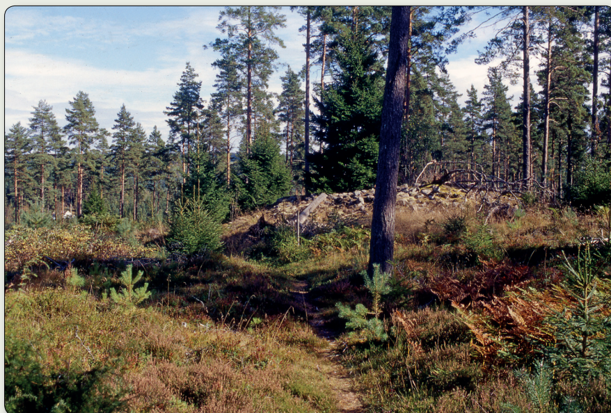
One of the many burial cairns on the plateaus to the west of Lake Stråken.

N 6426125 / E 429226 (SWEREF 99 TM) // N 57° 58' 16.16", E 13° 48' 12.91" (WGS84)