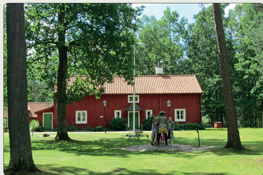
The vicarage is now a museum, with e.g. a collection of tapestry paintings on the first floor.