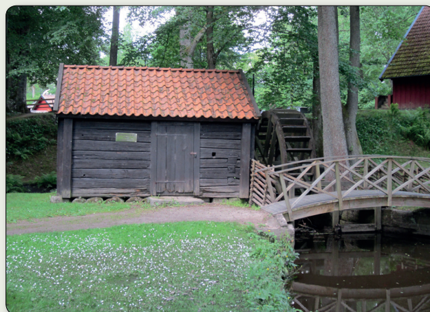
The wire-drawing mill and water wheel, where thin wire was made from heavy iron-wire.

There are several buildings in the park that are linked to old crafts, such as a pottery, woodturning and shoemaking. In the pottery, you can see furnishings and a kiln from a workshop in Västhorja, which was in operation from the early 1800s until 1920. The Gelb foundry was a typical mechanical workshop from the 1920s. Brass items were cast here. A water wheel operates the old wire-drawing mill from Götarp near Åsenhög. Thin wire was made here from heavy iron-wire and sold to small industries in the district. The market stall, also called Mother Kajsas's Cottage, is one of the oldest buildings in Apladalen. It was originally one of 56 market stalls along the street Boagatan in Värnamo, where several markets a year were held in the 17th to the 19th centuries. The ridge cottage Ryggåsstugan comprises a porch, a kitchen and a front room. The walls are not more than one metre high, and therefore the ceiling is open up to the roof. Two rooms have been added at the gable ends. The cottage and its furnishings give a picture of living conditions more than 100 years ago.