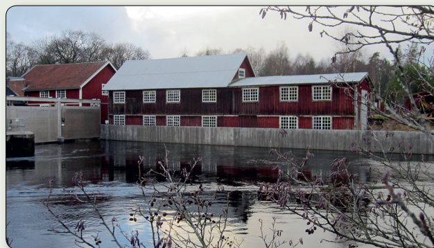
The sawmill is located north of the intake by the mill.

Eel was fished here, and Bölaryd was mentioned as a good place for eel fishing already in the 17th century.