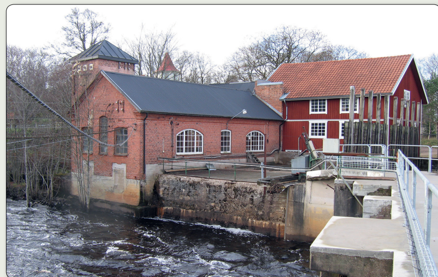
The power station and mill. The tower of the works manager's residence is seen in the background.

N 6332405 / E 402341 (SWEREF 99 TM) // N57° 07' 28,27 E 13° 23 13,23" (WGS84)