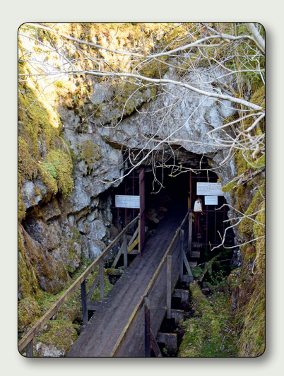
Hörnebo was an open cast slate mine, with blasted workings at the bottom.